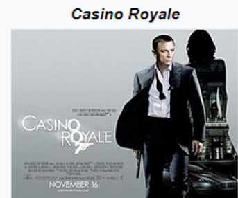
UK theatrical release poster

To recoup his clients' money, Le Chiffre organizes a Texas hold 'em tournament at the Casino Royale in Montenegro. MI6 enters Bond — the agency's best poker player — in the tournament, believing a defeat will force Le Chiffre to seek asylum with the British government in exchange for information on his clients. Bond is paired with Vesper Lynd, a British Treasury agent overseeing the $10 million buy-in. They meet their contact, René Mathis, in Montenegro. Obanno, furious that his money is missing, threatens Le Chiffre but allows him to continue playing to win back the money. Obanno and his bodyguard attack Bond, who kills them both. Bond loses his $10 million stake after Le Chiffre is tipped off about his own tell, and Vesper refuses to authorize an additional $5 million for Bond to continue. However, fellow player Felix Leiter, a CIA agent, stakes Bond to the money in exchange for letting his agency take Le Chiffre into custody. Le Chiffre's lover, Valenka, poisons Bond's martini, but Vesper rescues him. Bond returns to the game and wins the tournament. Le Chiffre kidnaps Vesper to trap Bond and takes them to an abandoned ship. He tortures Bond to reveal the password to the bank account holding the winnings, but Bond resists. Mr. White bursts in and kills Le Chiffre but inexplicably spares Bond and Vesper.